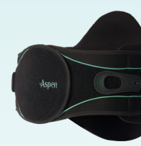
Summit 637 LSO Summit 631 LSO