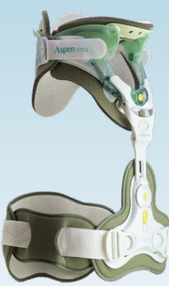
Vista CTO Vista CTO4