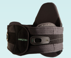
Horizon 637 LSO Horizon 631 LSO