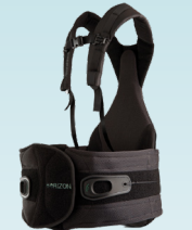
Horizon 456 TLSO