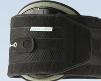
QuikDraw RAP QuikDraw PRO