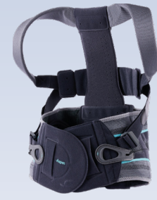
Aspen Elite TLSO