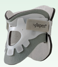
Aspen Cervical Collar Aspen Paediatric Collar