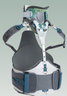
Vista II CTLSO