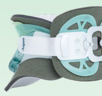
Vista II Collar