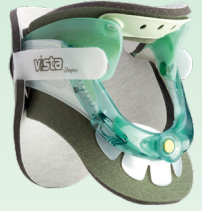
Vista Collar Vista ICU (Back Panel Only) Vista TX Collar