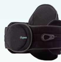
Aspen Sierra 637 LSO