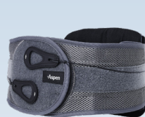
FLX 627 Lumbar