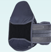
FLX 637 LSO FLX 631 LSO