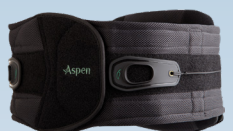
Horizon 627 Lumbar