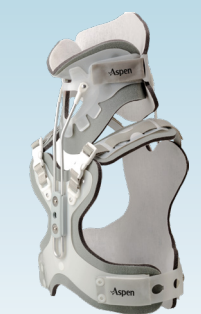
Aspen CTO Aspen Paediatric CTO