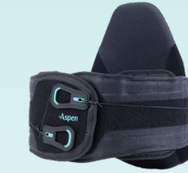
Horizon PRO 637 LSO Horizon PRO 631 LSO