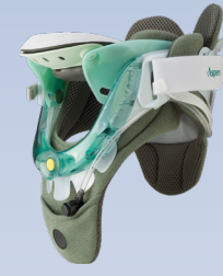
Vista Multipost Therapy Collar