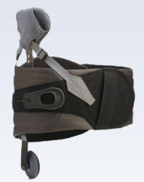
Aspen Tri-Point FSO