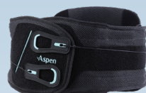
Horizon PRO 627 Lumbar