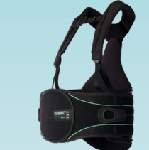
Summit 456 TLSO