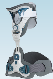
VRTX CTO VRTX CTO4