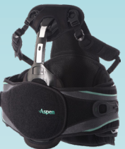
Vista 464 TLSO