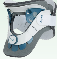
VRTX Collar VRTX Multipost Collar VRTX TX Collar