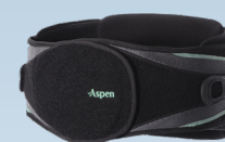
Vista 627 Lumbar