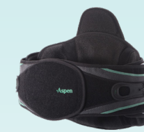
Vista 637 LSO Vista 637 LSO LoPro