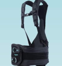
Horizon PRO 456 TLSO