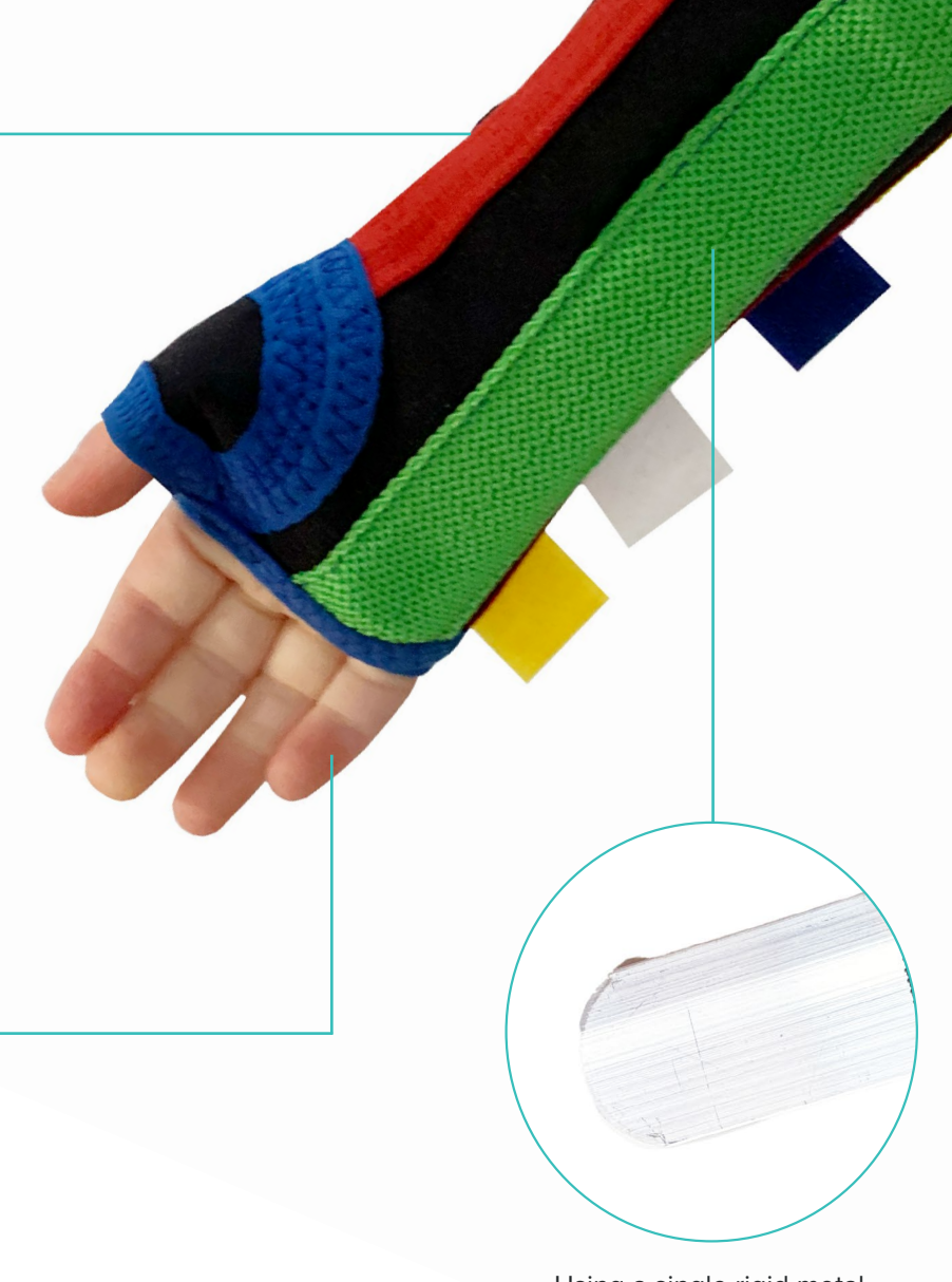
Using a single rigid metal splint piece, this brace works by keeping the wrist bone and forearm in place whilst healing occurs following an injury.