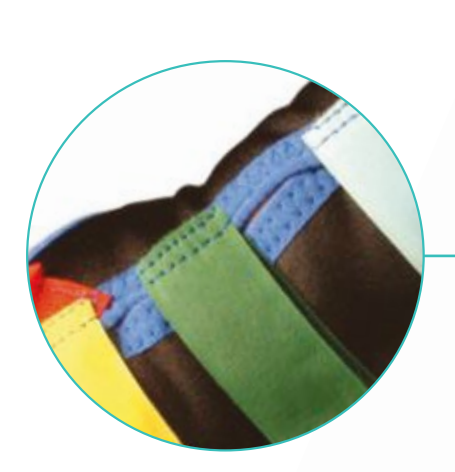
Lycrafleece material is designed to be tough, durable and comfortable, while remaining breathable to help with temperature regulation.