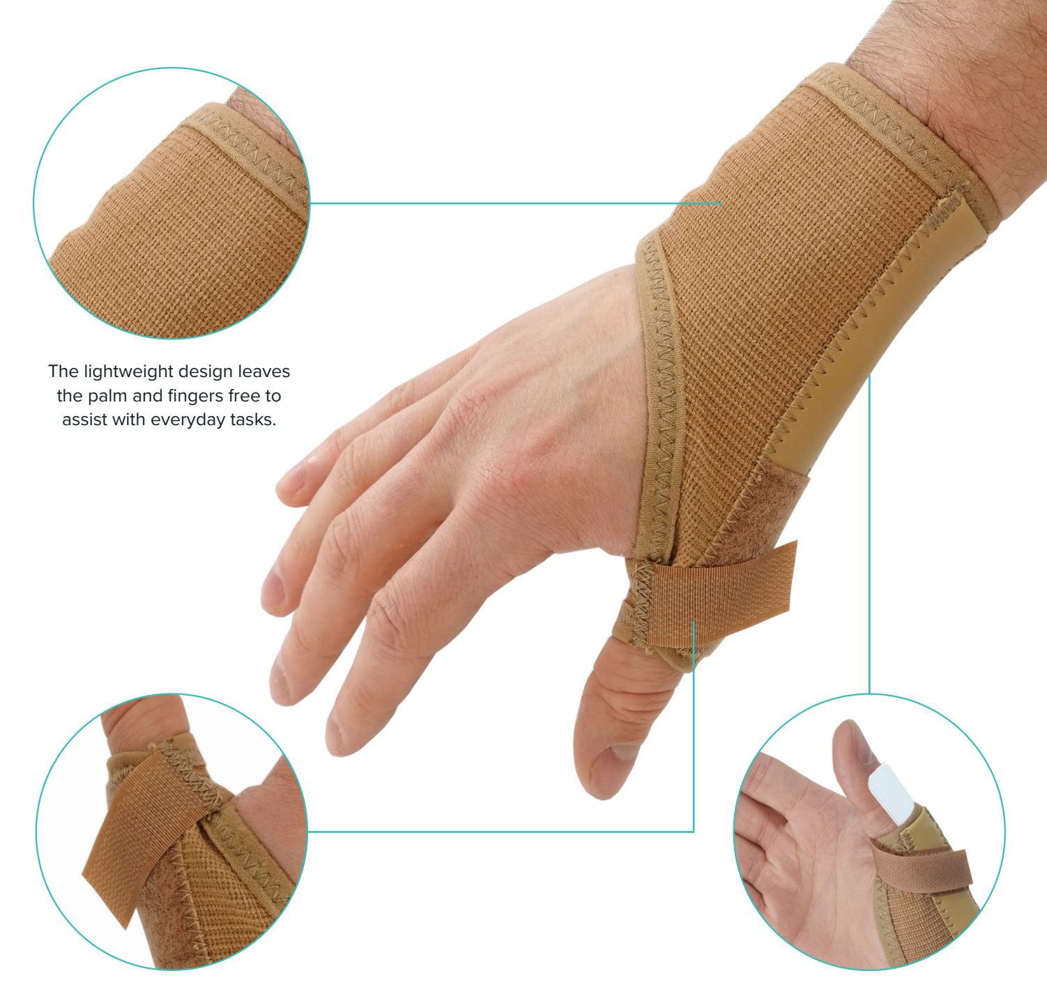
Convenient hook / loop closures make it easy to adjust the support, and are ideal for users with limited dexterity.